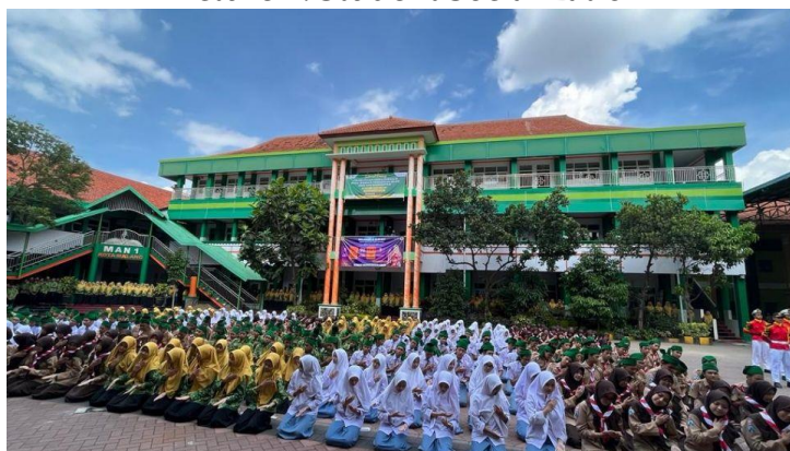
Picture 2. Student Socialization

Source: https://man1kotamalang.sch.id/web/