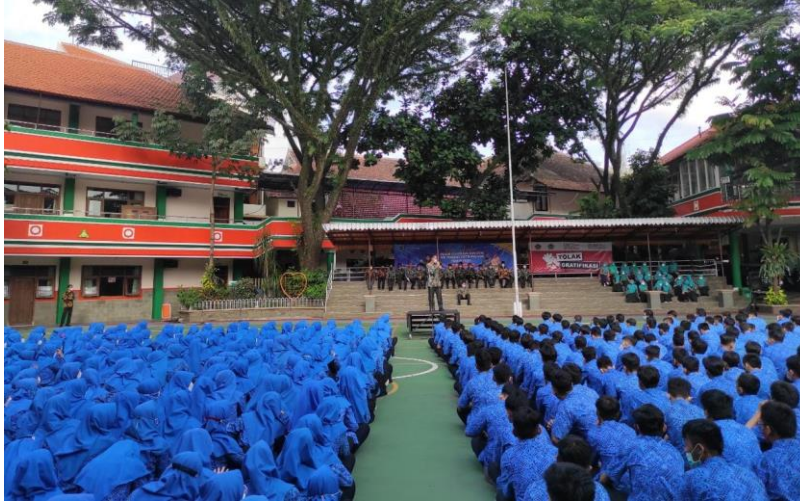
Picture 1. Student Socialization